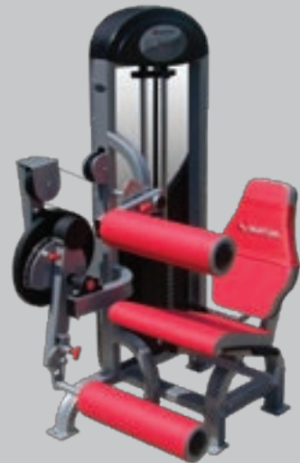
[QPS-6556] Seated Leg Curl/Leg Extension