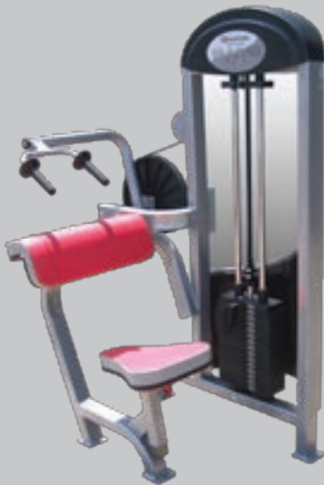
[QPS-6018] Triceps Extension