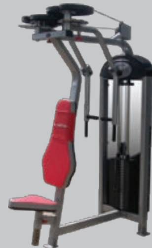
[QPS-6516] Pec/Rear Delt