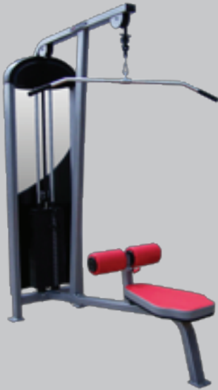
[QPS-6300] Lat Pulldown