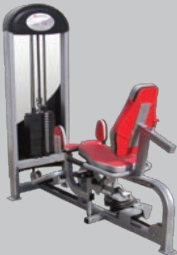
[QPS-6566] Hip Abduction/Adduction