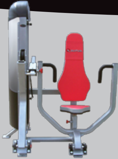
[QPS-6004] Vertical Chest Press