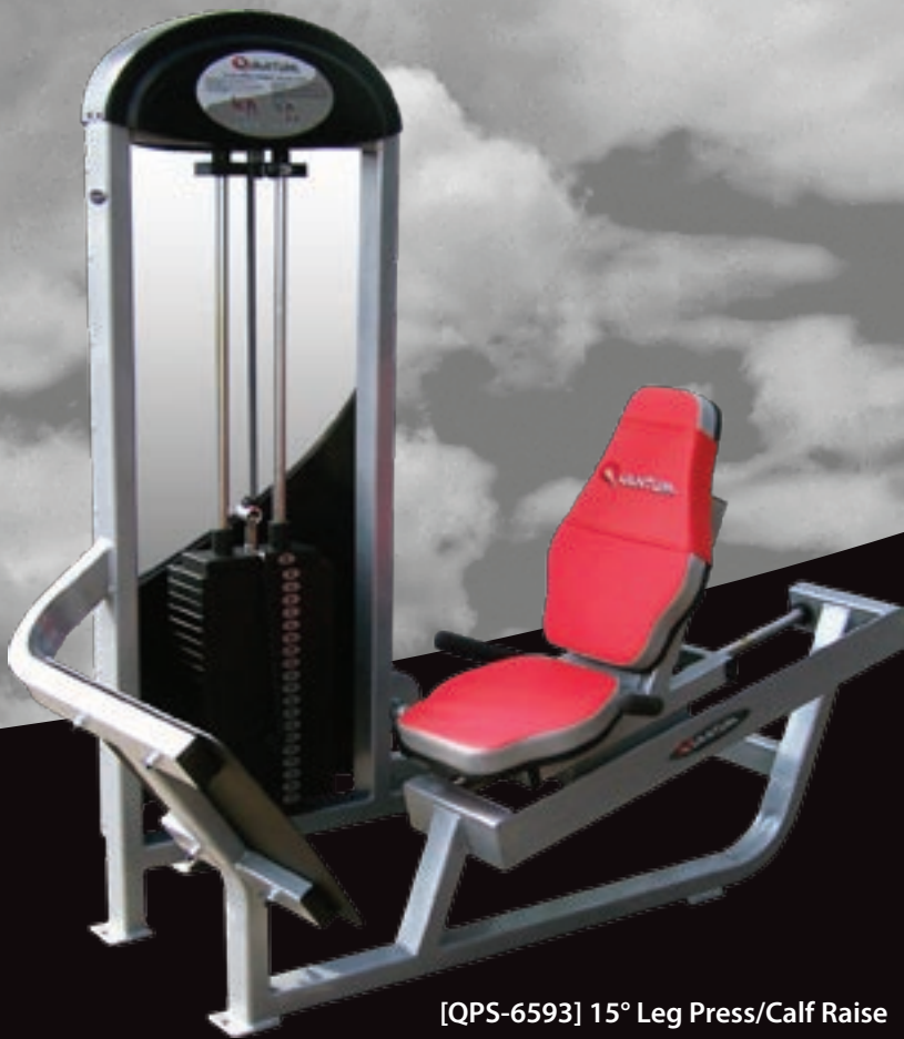
[QPS-6593] 15° Leg Press/Calf Raise