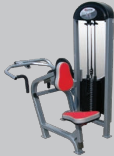
[QPS-6540] Seated Row/Upper Back