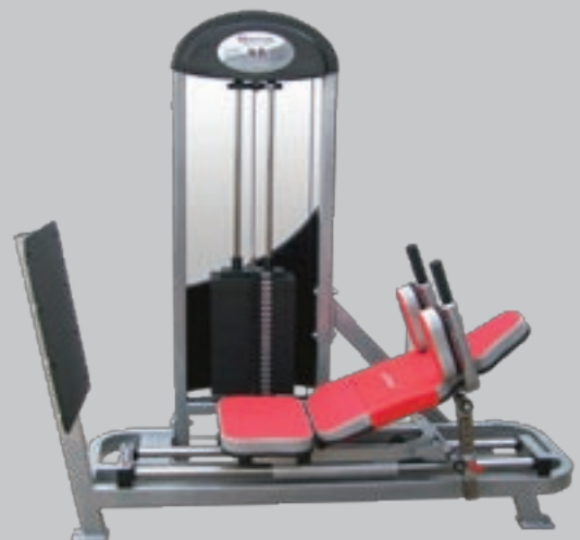
[QPS-6036] Horizontal Leg Press