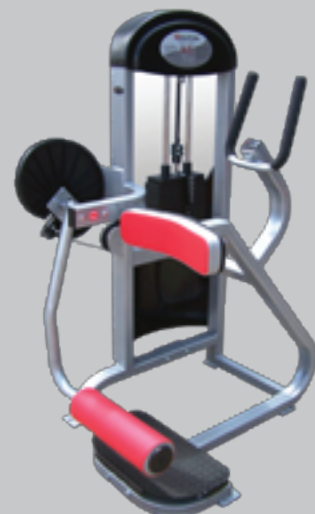
[QPS-6580] Glute Shaper