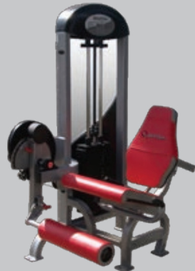
[QPS-6030] Leg Extension w/ASR