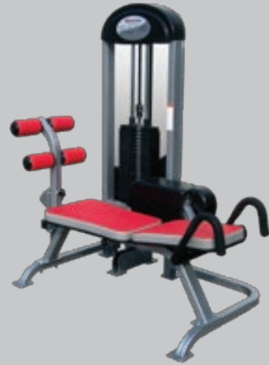
[QPS-6200] Power Crunch 2000