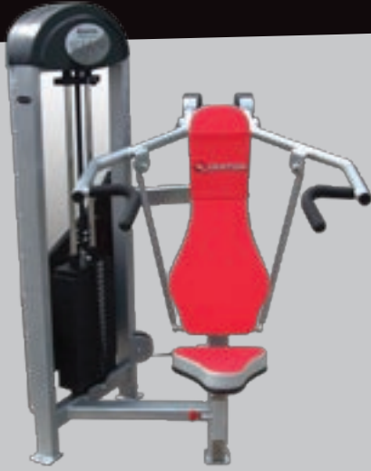
[QPS-6112] Converging Shoulder Press