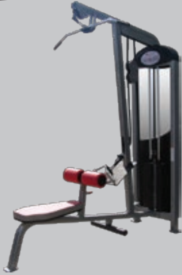
[QPS-6519] High Lat/Mid Row