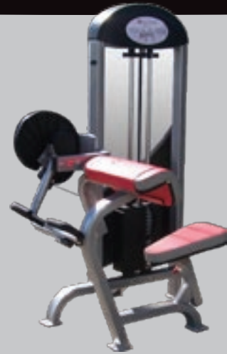
[QPS-6016] Biceps Curl