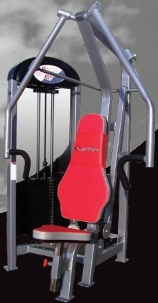
[QPS-6113] Converging Chest Press