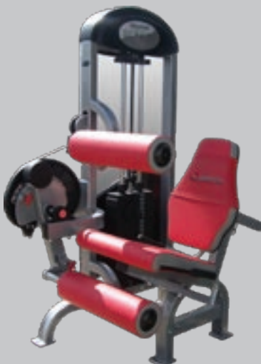
[QPS-6034] Seated Leg Curl w/ASR