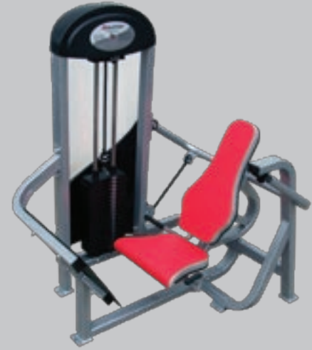
[QPS-6500] Power Quad